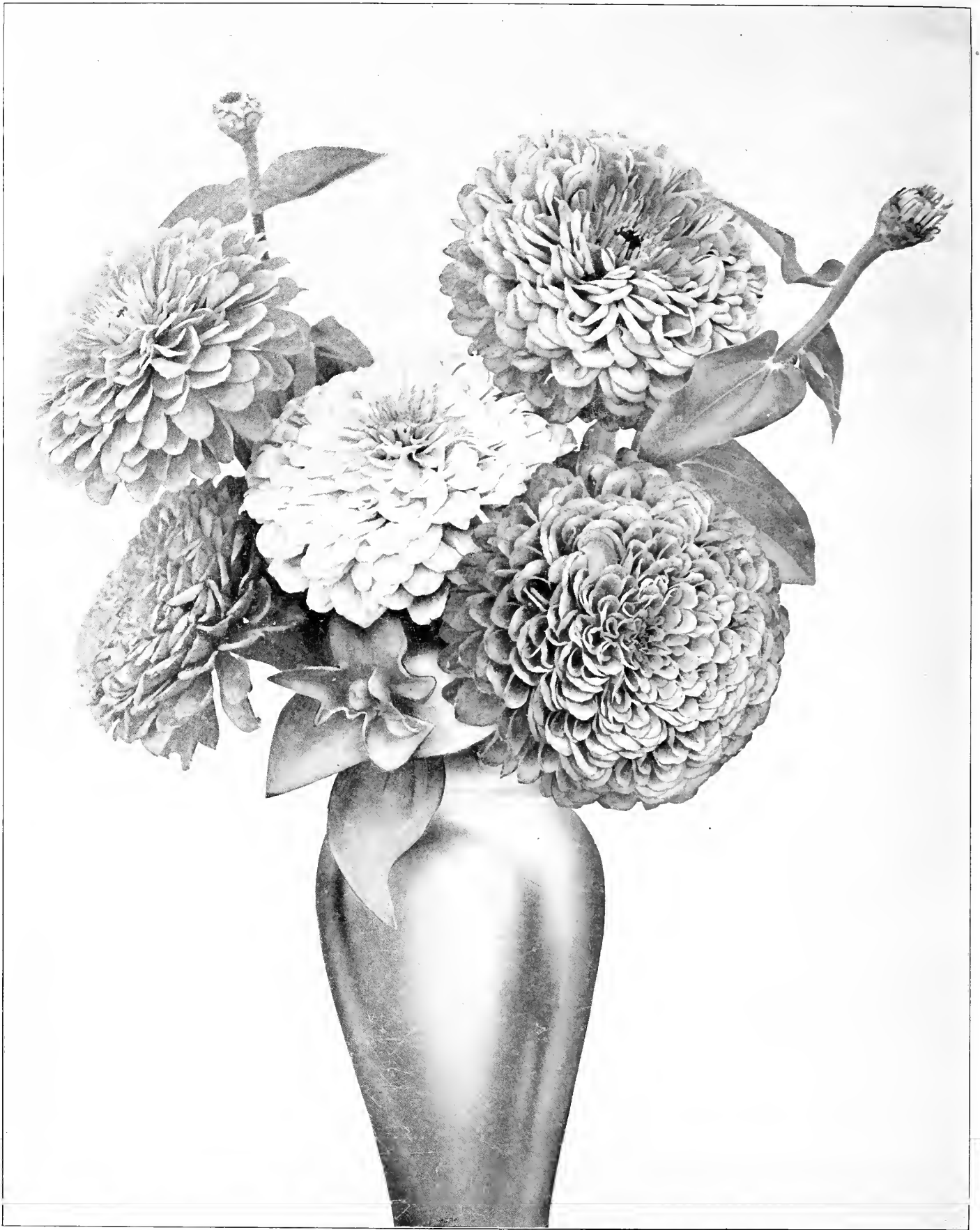
ZINNIA—BODGER'S GOLD MEDAL DAHLIA FLOWERED